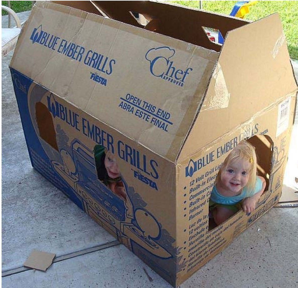
Build a Play House or Fort