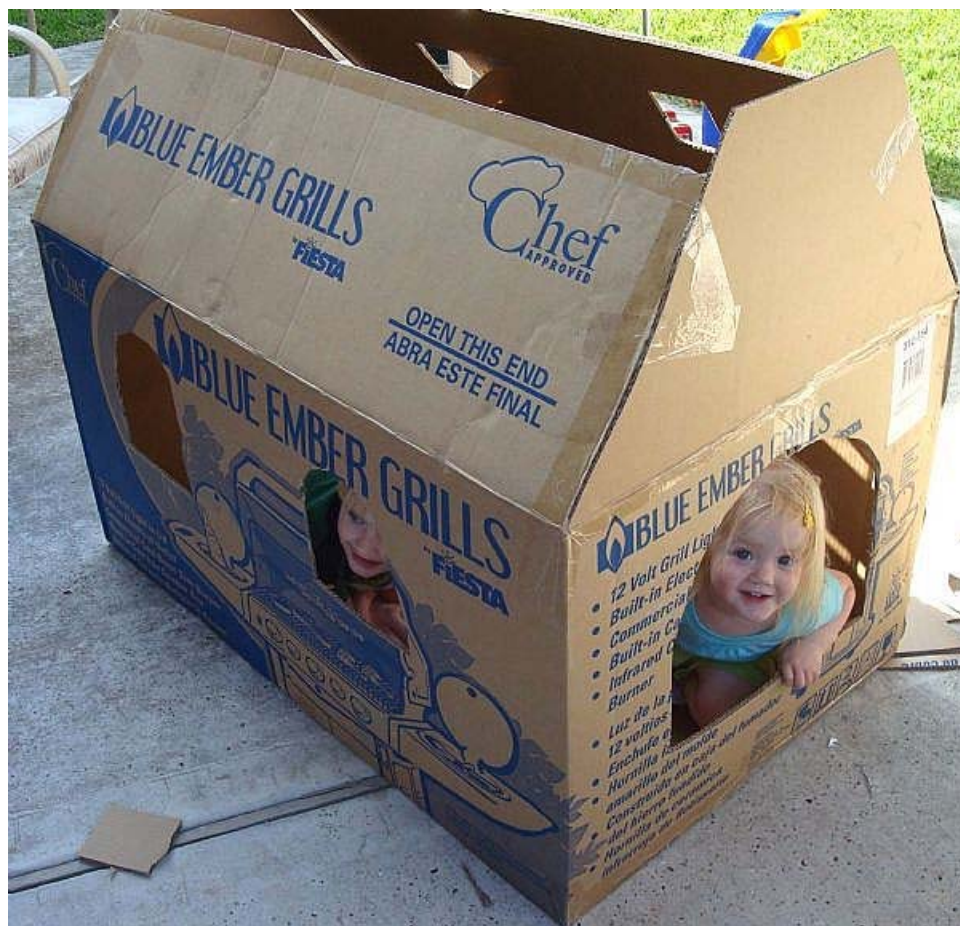
Build a Play House or Fort